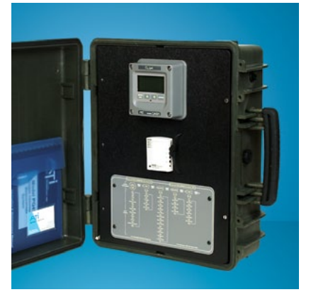
PQ45 Portable H<sub>2</sub>O<sub>2</sub> Data Logger