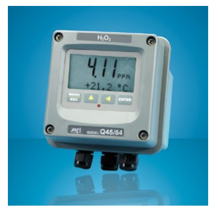
H<sub>2</sub>O<sub>2</sub> Loop-Powered Transmitter