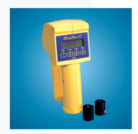
Portable H<sub>2</sub>O<sub>2</sub> Gas Detector

ATI also offers a loop-powered dissolved peroxide monitor for those applications where extra outputs and/or relays are not required. A battery powered portable unit is also available with an internal data logger for temporary monitoring applications. And for safety around your peroxide system, ATI manufactures a variety of portable and fixed point gas detectors.