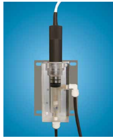
Sealed Acrylic Flowcell