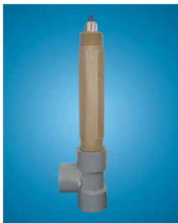
1" Flow Tee

The 1-1/2" or 2" union mount systems can be used with pipe sizes up to 2 inches. The union mount hardware allows for easy removal of the sensor from the hardware without twisting the sensor cable.