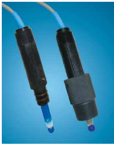
Twist-Lock Sensor (with or without pipe adapter)