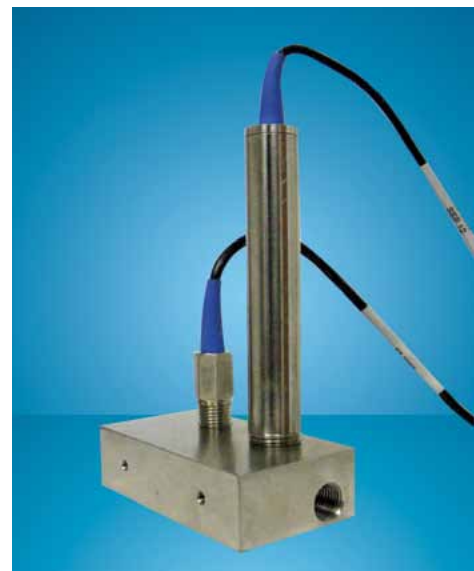
High Purity Water Sensor & Flowcell

Superior Sensor Technology for Advanced Process Measurement.