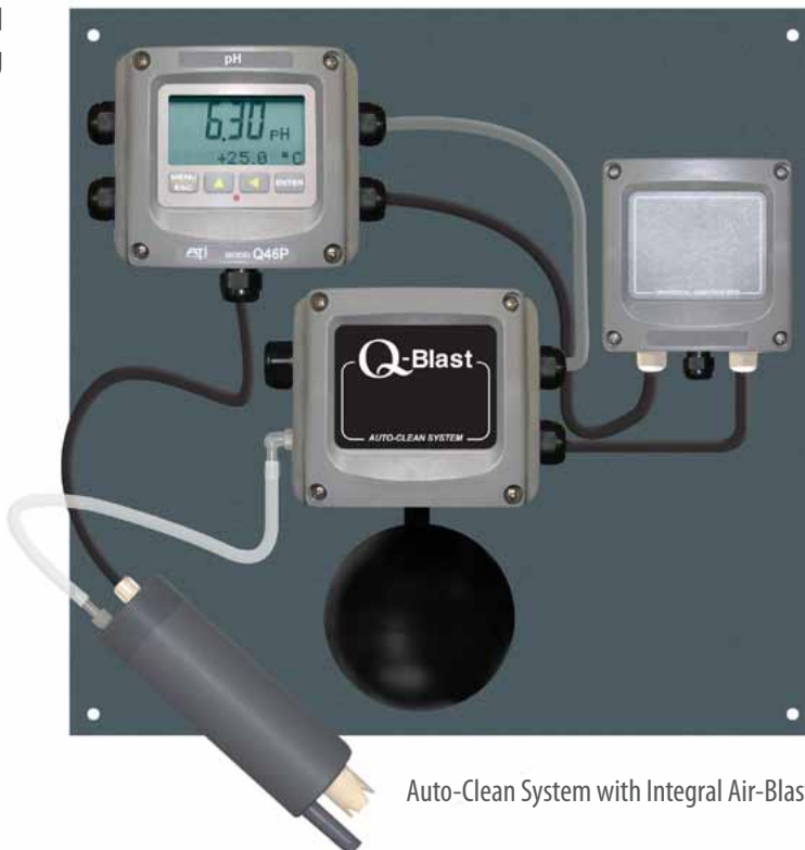
Auto-Clean System with Integral Air-Blast

A Blast of Air keeps the Auto-Clean Sensor Clean!