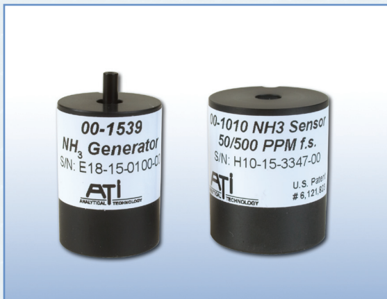
Optional Auto-Test Generator