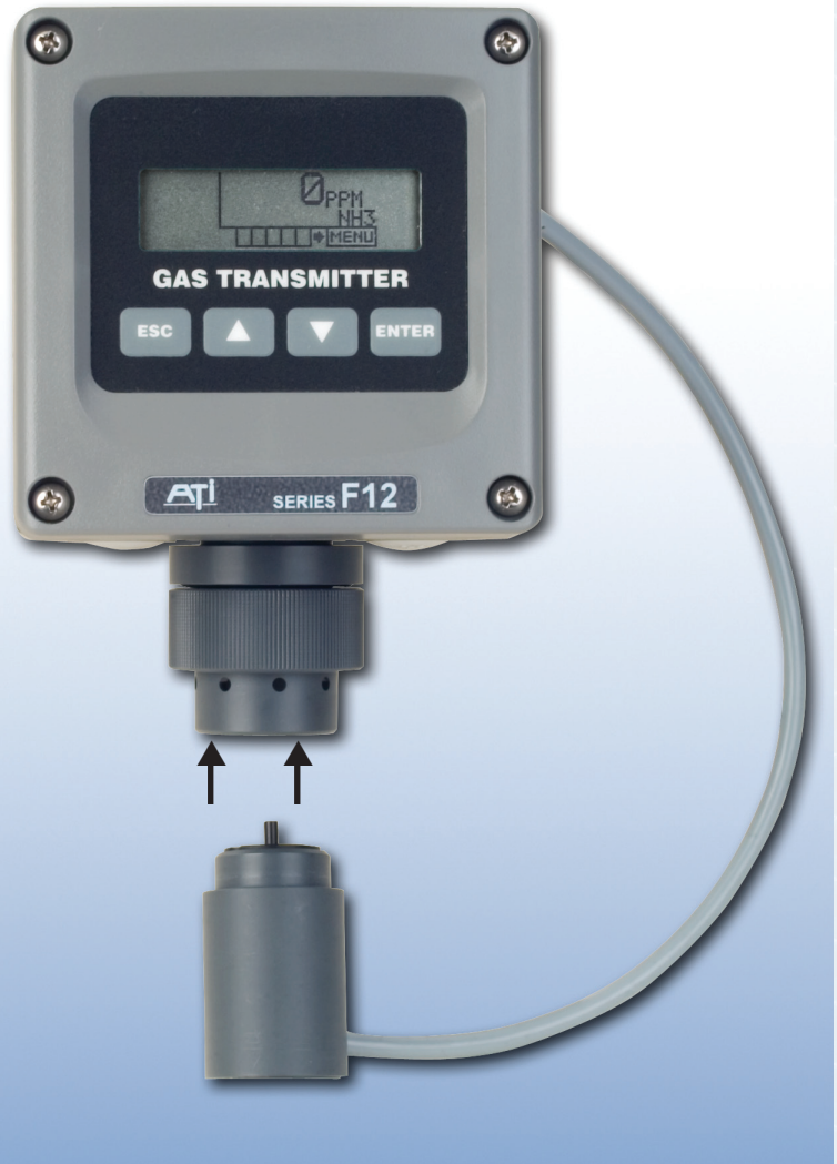
Model F12 With Optional Auto-Test Generator

For general purpose gas detection applications, the F12 transmitter is also available in Non-IS versions. One version provides for easy interface to RS-485 networks using a standard MODBUS™ communication protocol. A second version provides a complete AC powered instrument with 3 alarm relays (SPST) available for external alarming.