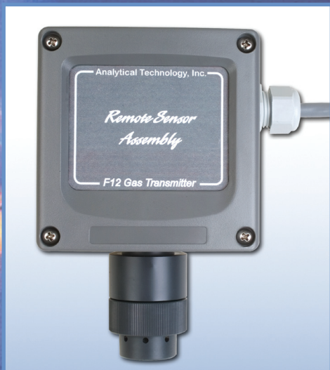
Remote Sensor Option