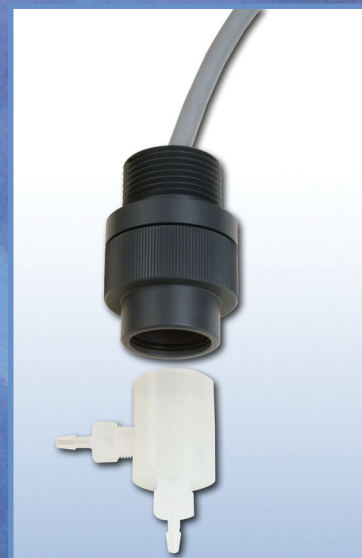
Separated Sensor with Flow Cell