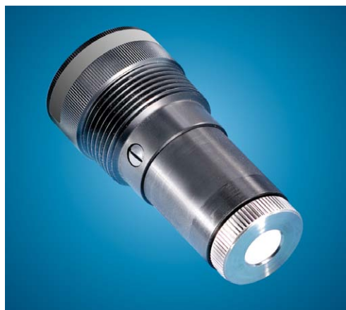
Q46H Flowcell Style Sensor

ATI's Model Q46H Chlorine Monitor is an upgraded version of our proven Q45 system for continuous monitoring of free or combined chlorine. Monitor capabilities have been expanded to include options for a 3rd analog output, or for adding additional low power relay outputs. Digital communication options for Profibus, Modbus, or Ethernet have also been added.