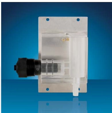
Constant Head Flowcell