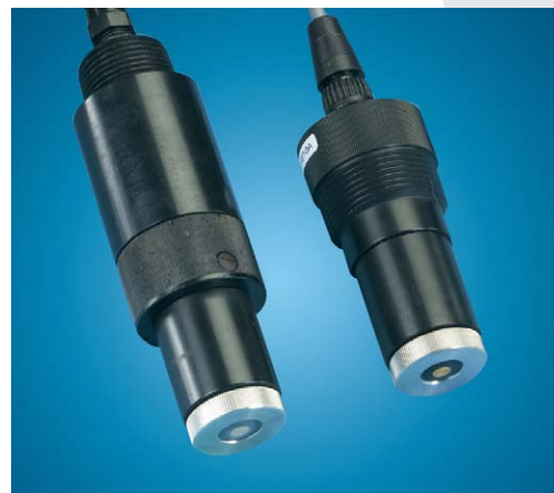
Submersion and Flowcell Sensors

Submersible combined chlorine sensors can sometimes be used for measuring total chlorine in wastewater effluent. Wastewater effluents containing more than 1 PPM of ammonia often result in a chlorine residual that is more than 90% monochloramine. Direct measurement with a submersible sensor can provide a dependable monitor without all the sampling and chemicals associated with total chlorine measurement.