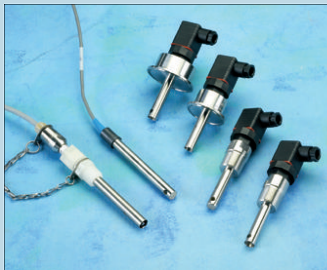
2 Electrode Sensors

The sensor should be installed horizontally with the electrodes directed into the on-coming flow of water. This prevents air bubbles and particulates from collecting in the space between the two electrodes. Any obstruction