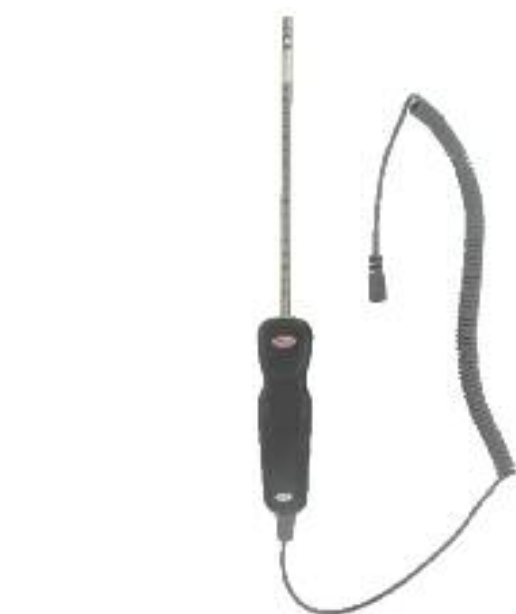
Replaceable Probe with Secure 6 Pin Adapter