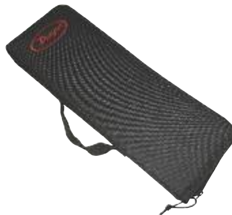
Soft Carrying Case Included with Every Unit